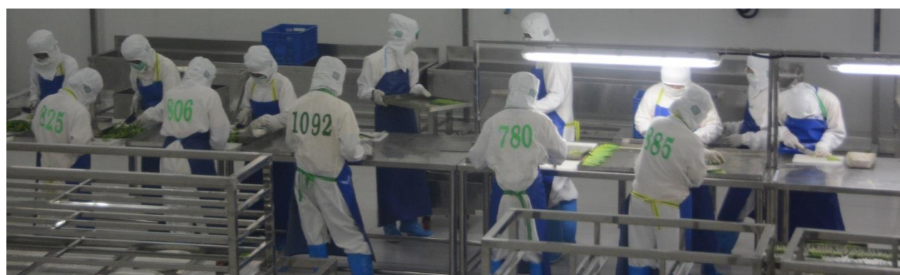
Workers launch the processing lines at Myanmar AgriFood's frozen factory.